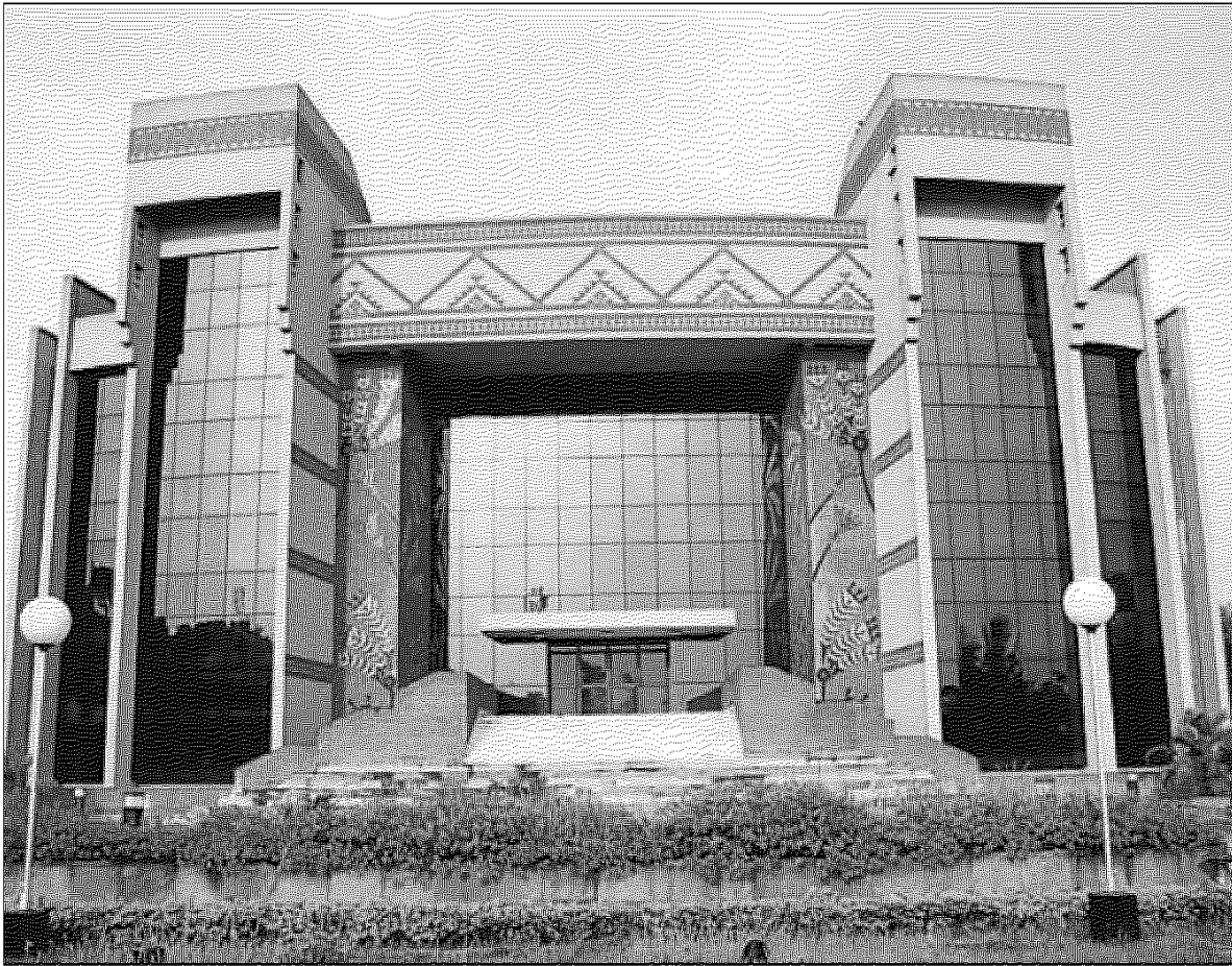
* A view of the IIM-Calcutta campus. IIM-C is one of the most coveted B-schools anywhere in the country.